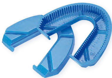
memory-trays for inexpensive archiving