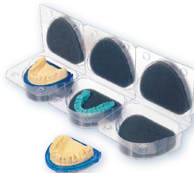
model-pack transport boxes for secure shipping